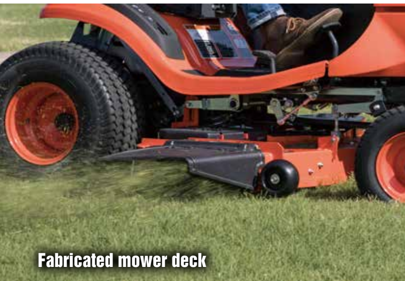
Fabricated mower deck

Step up to the Kubota T Series and get more of everything you want in a premium lawn tractor. More comfort to keep you relaxed and refreshed. More convenience to make the job easier. More efficiency to get the job done fast. And, of course, more Kubota dependability and durability to keep your T Series doing what the T Series does best: making your lawn look great.