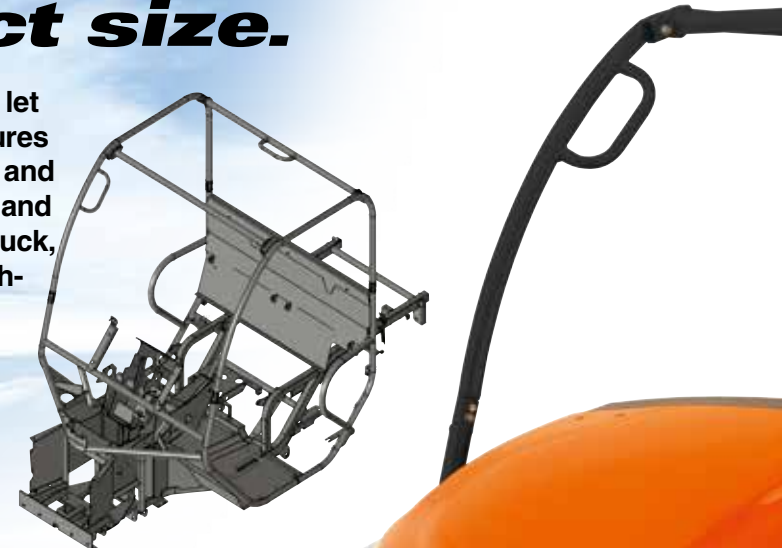
Standard Frame-integrated ROPS