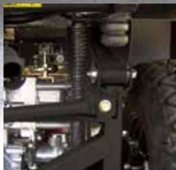
Smooth, Reliable Semi-independent Rear Suspension