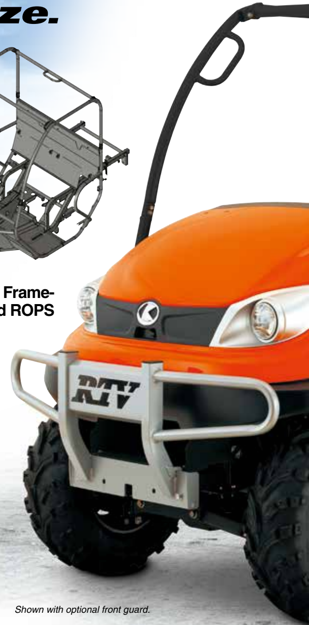
Shown with optional front guard.